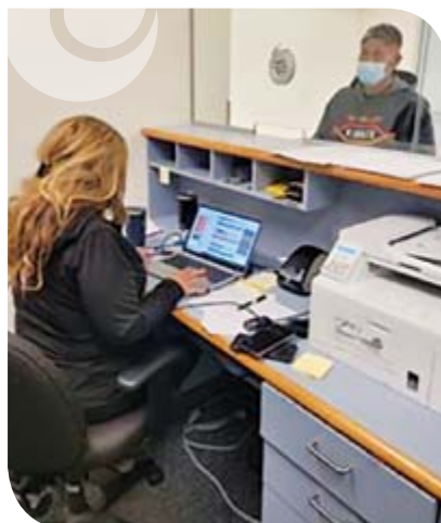
International Agricultural Worker Health Clinic in Simcoe