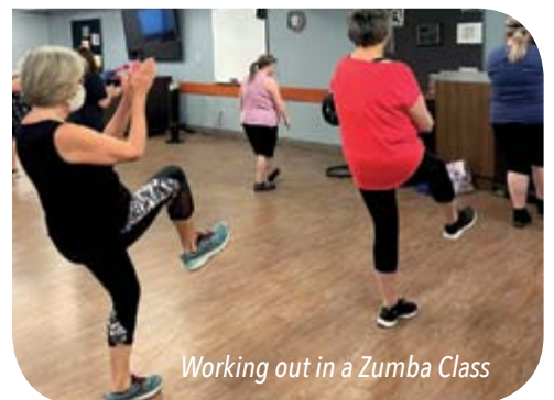
Working out in a Zumba Class