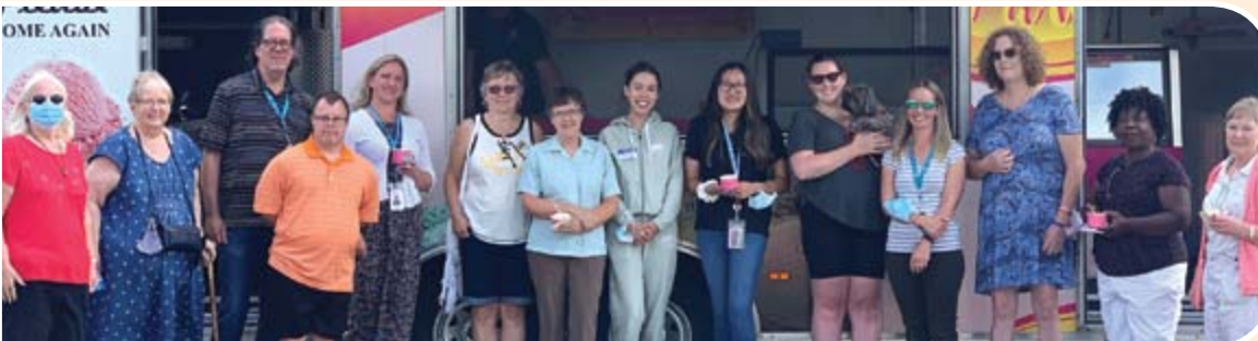
GRCHC volunteers enjoyed a visit from the ice cream truck at our annual volunteer appreciate event on August 9, 2022

“My Nurse Practitioner listens to me and asks questions. She gives me choices on my treatment plan.” Primary Care